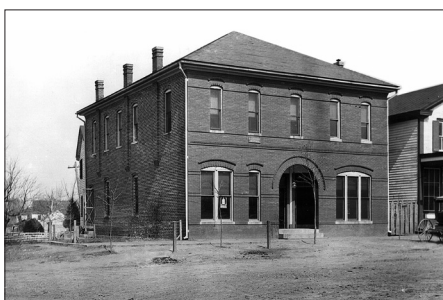
1902 original bank building