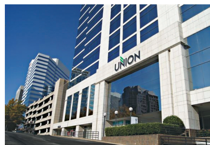
2017 headquarters at Three James Center, Richmond, Virginia