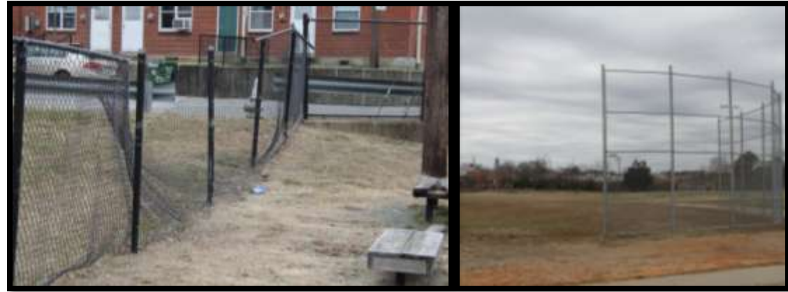
Before pictures of two Parks & Rec fields.

The 16 fields were chosen by the Greater Richmond Parks & Recreation Department based on the needs of each facility. Over 700 youth participated in the 2015 Parks & Recreation baseball league, and will be positively impacted by these field renovations. In early April 2016, the Flying Squirrels will team up with the Parks Department to host Opening Ceremonies at the fields and kick off the league's new season.