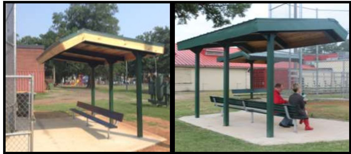
After dugouts were built at two of the fields.