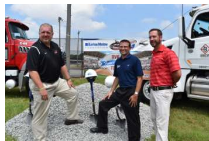
New dugout being installed at Blackwell Recreation Center.